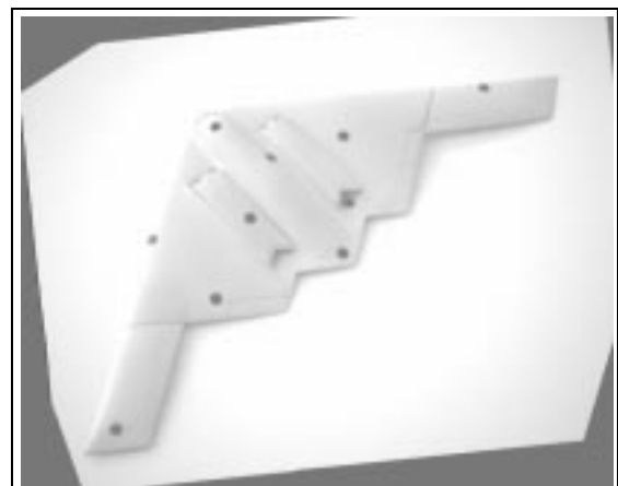
Figure 3. The motion compensated image resolved from the second frame (Fig. 2) into the first frame (Fig. 1).